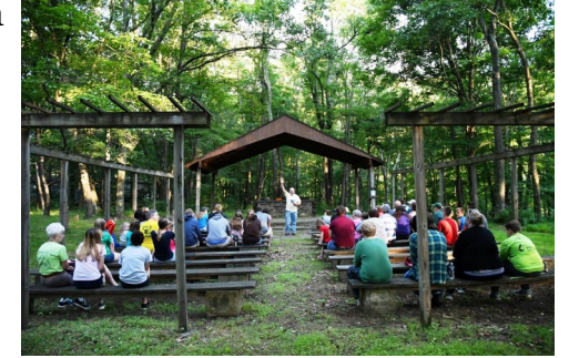
Worship during Family Camp

Founded in 1962, Camp Lackawanna is set in the majestic Endless Mountains of Northeastern PA along the Vosburg Neck on the Susquehanna River. The camp is owned and operated by the Presbytery of Lackawanna.